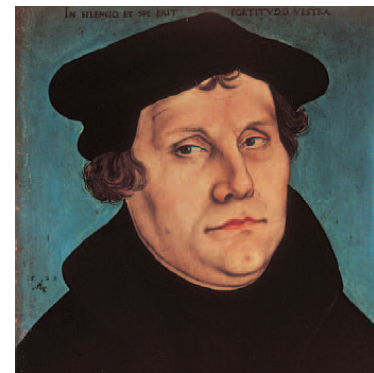
Martin Luther 1483–1546

In one way, fear led Luther to become a monk. At the age of 21, Luther was caught in a terrible thunderstorm. Convinced he would die, he cried out, "Saint Anne, help me! I will become a monk."